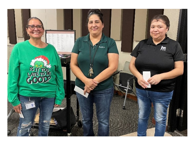
Plaza Café ladies receive Christmas gifts from OCFW members